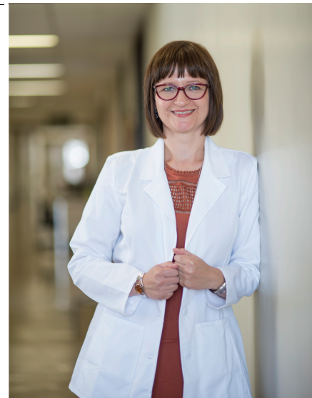
ROSALIND FRANKLIN UNIVERSITY OF MEDICINE & SCIENCE

"Oxytocin receptors in the bed nucleus of the stria terminalis (BNST) enable fear discrimination"